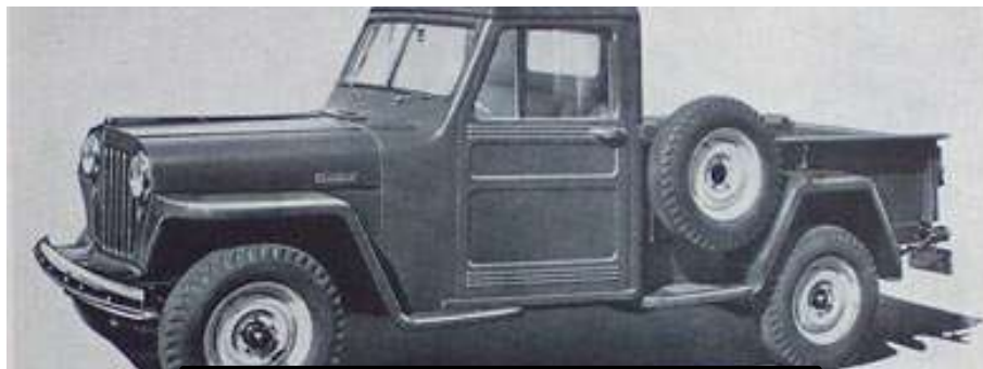
Willys Jeep used 1941-1945