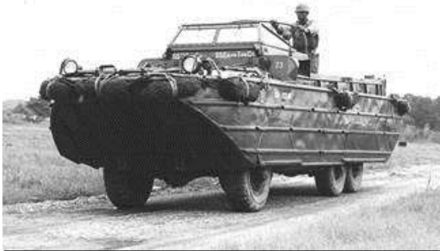
DUKW: A six-wheel-drive amphibious truck. D: 1942; U: utility; K: front-wheel drive; W: Two powered rear axles.