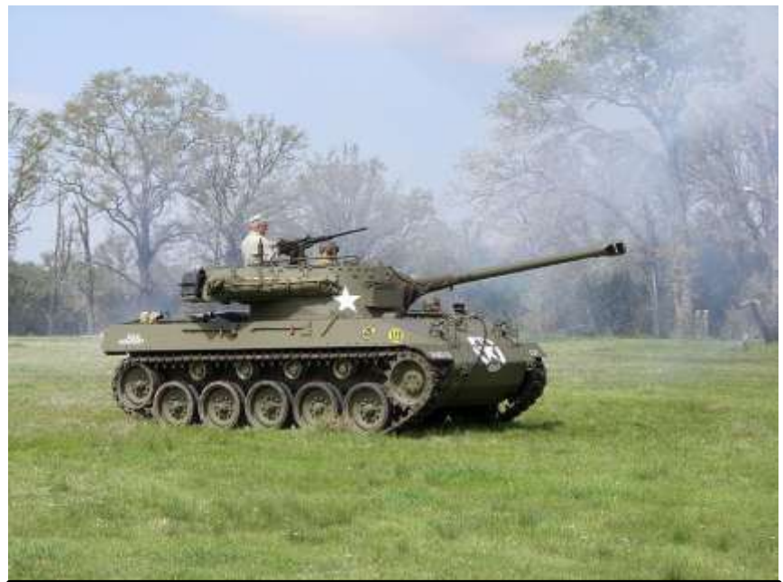
76mm M18 "Hellcat" Tank Destroyer with top speed of 60 mph.