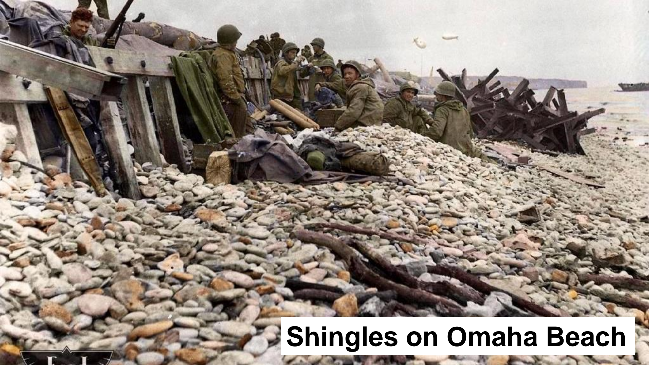
Shingles on Omaha Beach