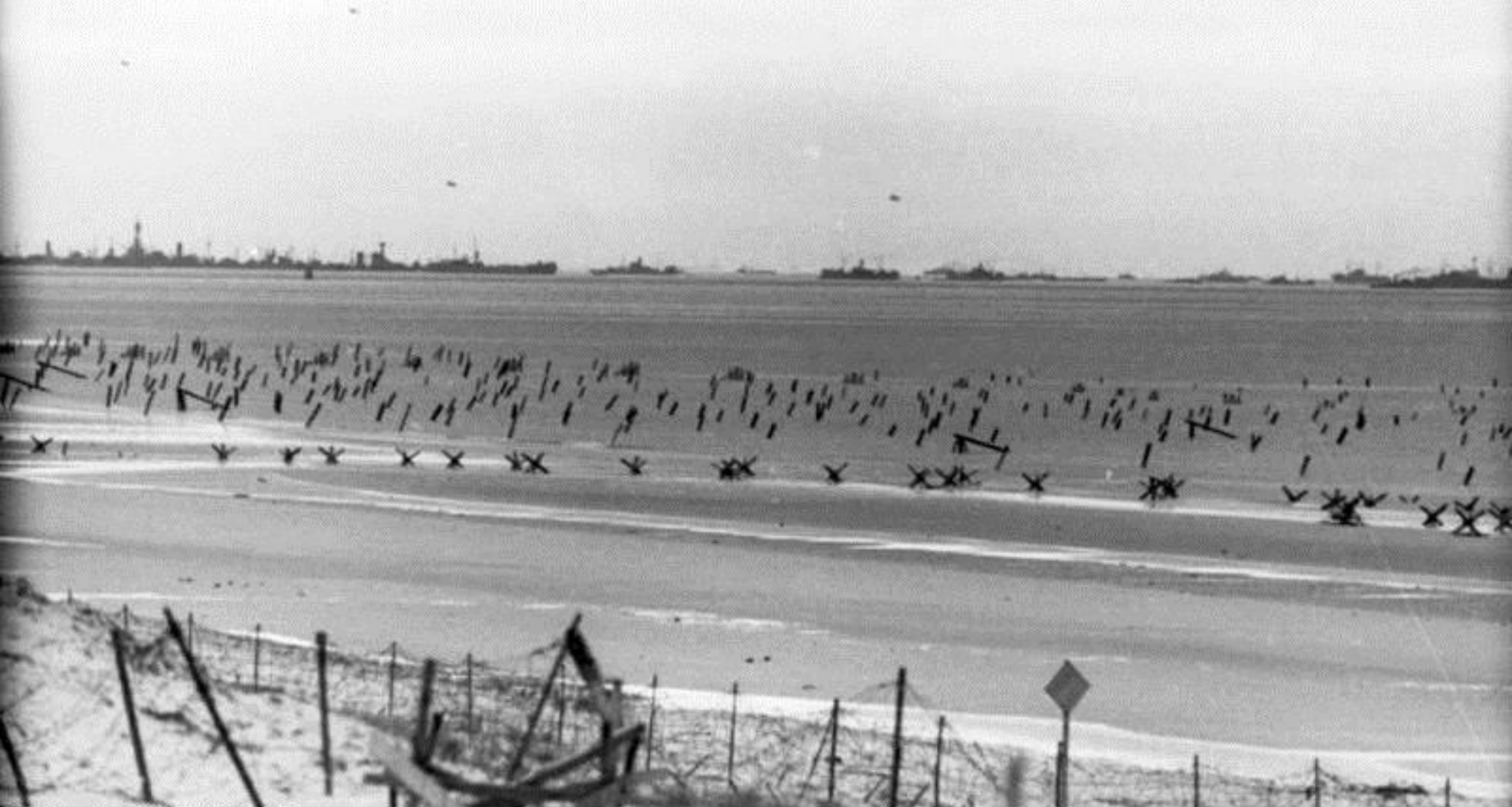
Juni 1944